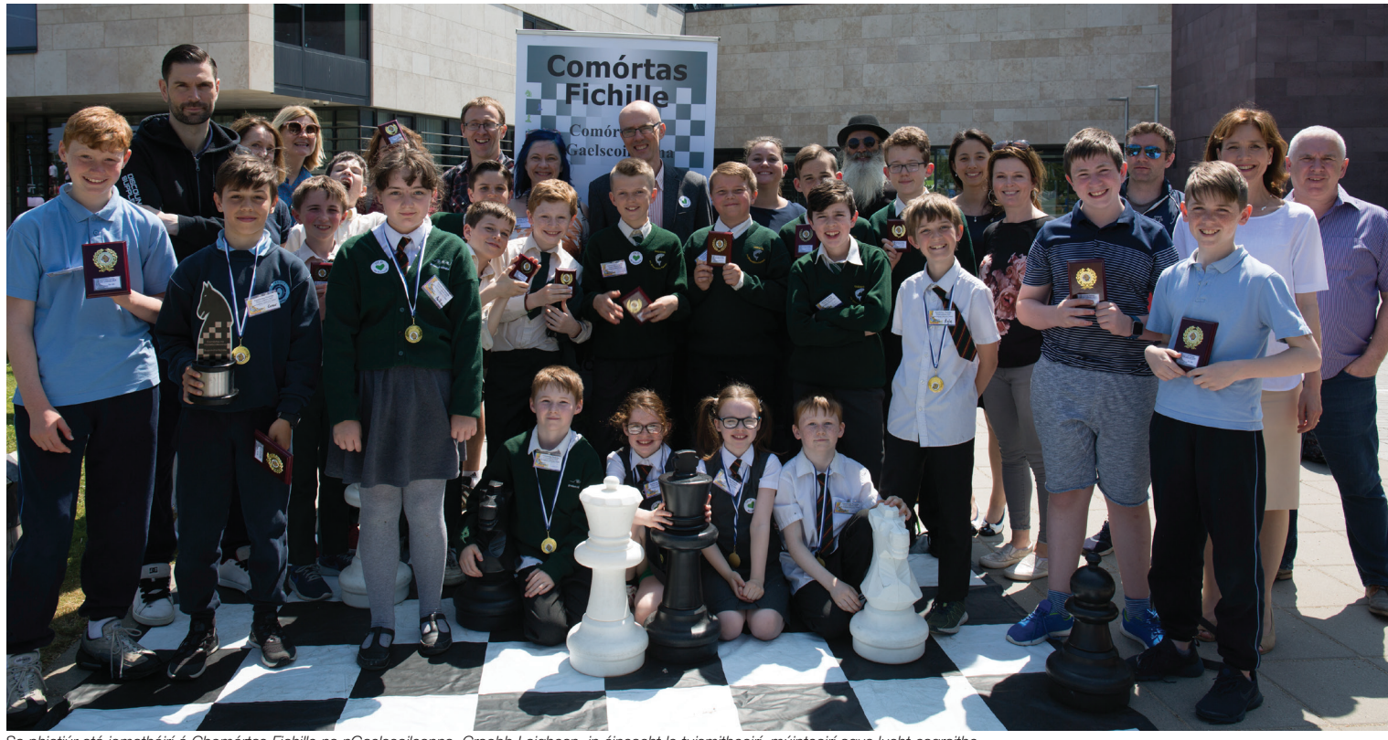
Sa phictiúr atá iomathóirí ó Chomórtas Fichille na nGaelscoileanna, Craobh Laighean, in éineacht le tuismitheoirí, múinteoirí agus lucht eagraithe